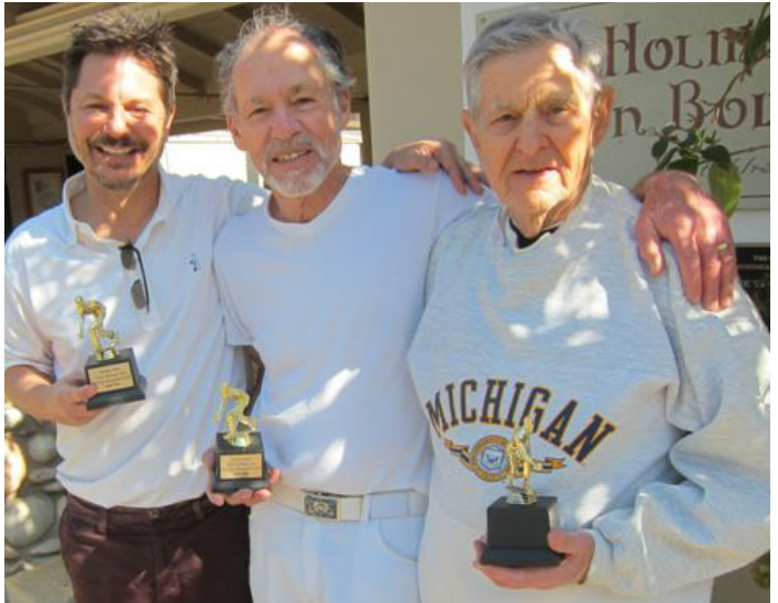
THE ALLISON SINGLES TOURNAMENT 2020.