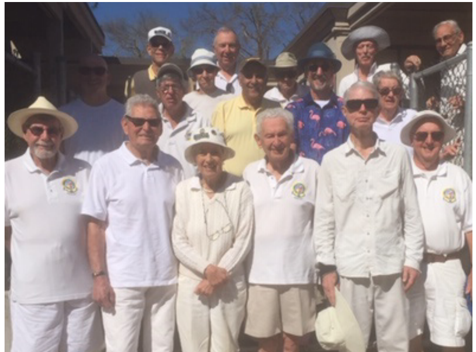
Participants of our Allison Singles tournament in February.

Our 2020 Calendar of Events was also completed and it is now available on our website. You may want to review these dates and try to synchronize your participation with your other obligations. This year, we are planning eight club tournaments and hope they will be well attended.